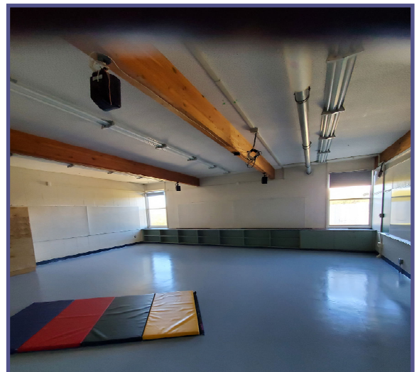
Classroom unusable for instruction due to railway