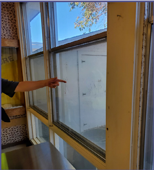
Single pane windows