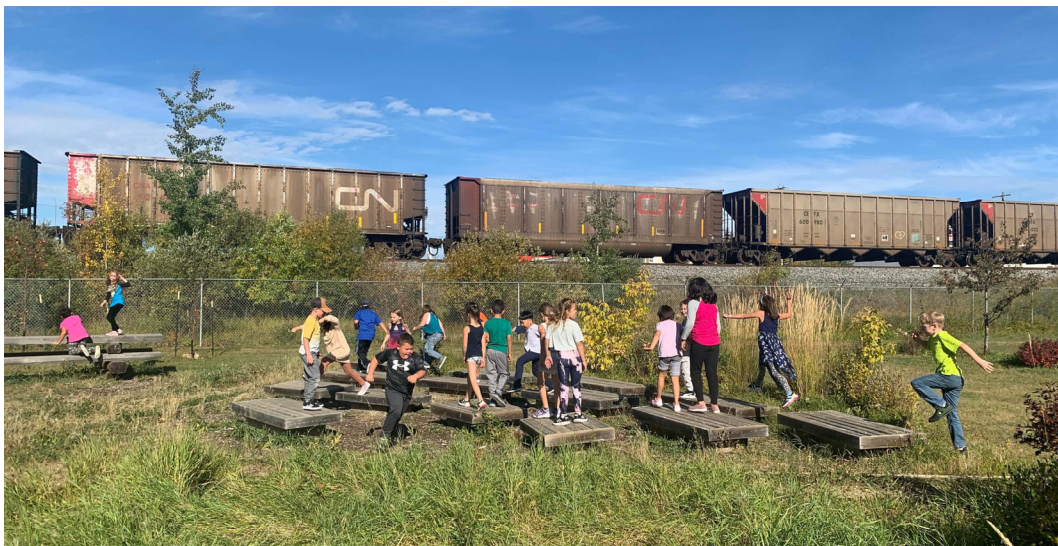
Close to railroad track and dangerous goods